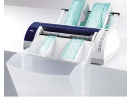
KEYPAD BAG HOLDER