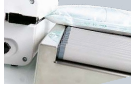
STAINLESS STEEL WORK SURFACE LARGE DISPLAY